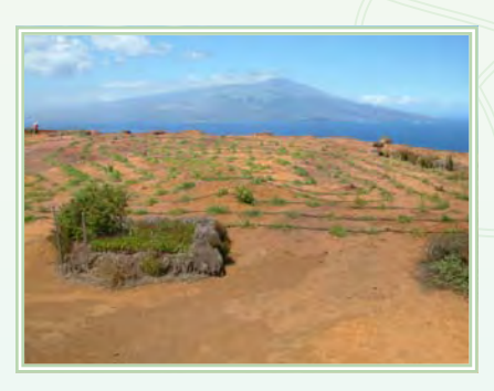
Pili grass "kīpuka" planter boxes and plantings along irrigation lines help stabilize soil

Planting areas threatened by alien species are managed to help re-establish the native forest. Invasive tree species are controlled by applying herbicide to the sapwood. Handtools and stump pullers are utilized to remove other alien plant species.