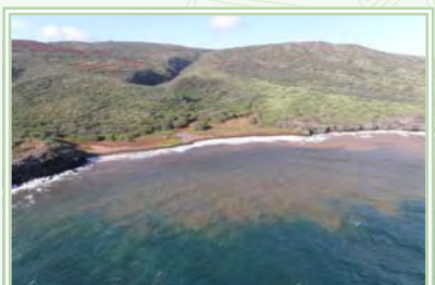
Hakioawa watershed is an area of historical significance and restoration effort. Note the erosional runoff after a heavy rain

Monitor, collect, and correlate data from USGS stream gages, turbidity monitors and soil erosion pin transects