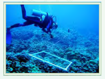
A member of the KIRC Ocean Program monitoring coral in Kaulana bay

The 2000+ volunteers make up the backbone of the watershed